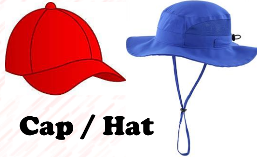
Cap / Hat