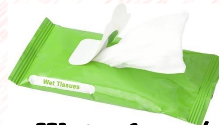
Wet wipes / Tissue paper