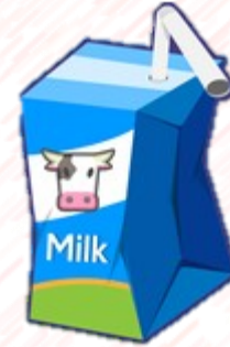
Packet milk / milo