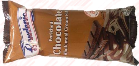
Bun / Bread