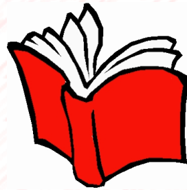
Small Story book