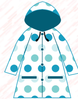
Raincoat / Poncho