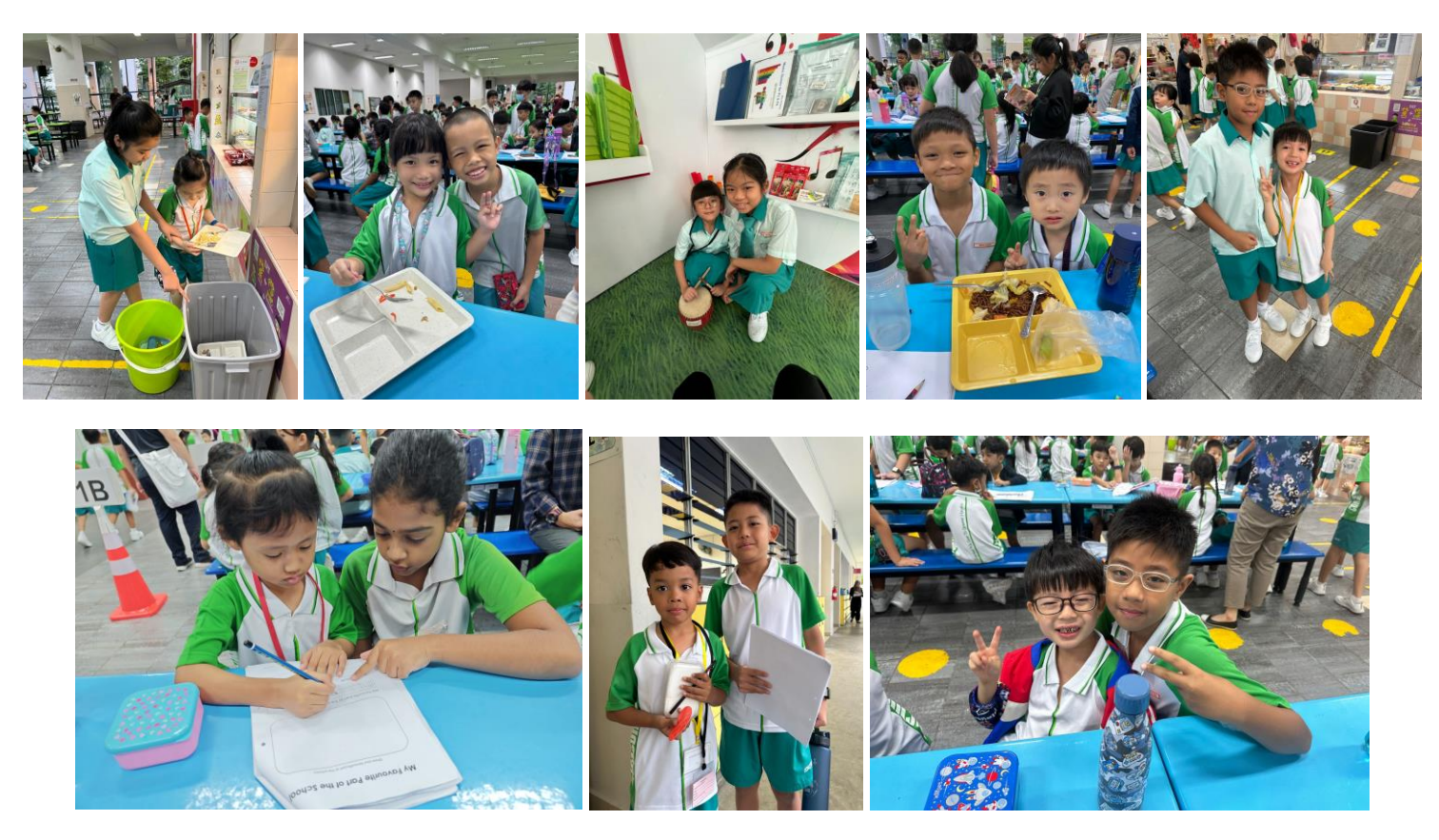
Primary 1 students with their Primary 4 buddies

Through these activities, the Primary 4 buddies played a crucial role in creating a supportive and welcoming environment for our newest students. This initiative not only helps Primary 1 students adjust to their new surroundings but also builds bonds between the students within our school community.