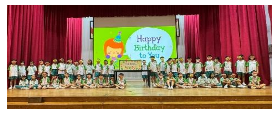
Wishing our March babies a Happy Birthday!