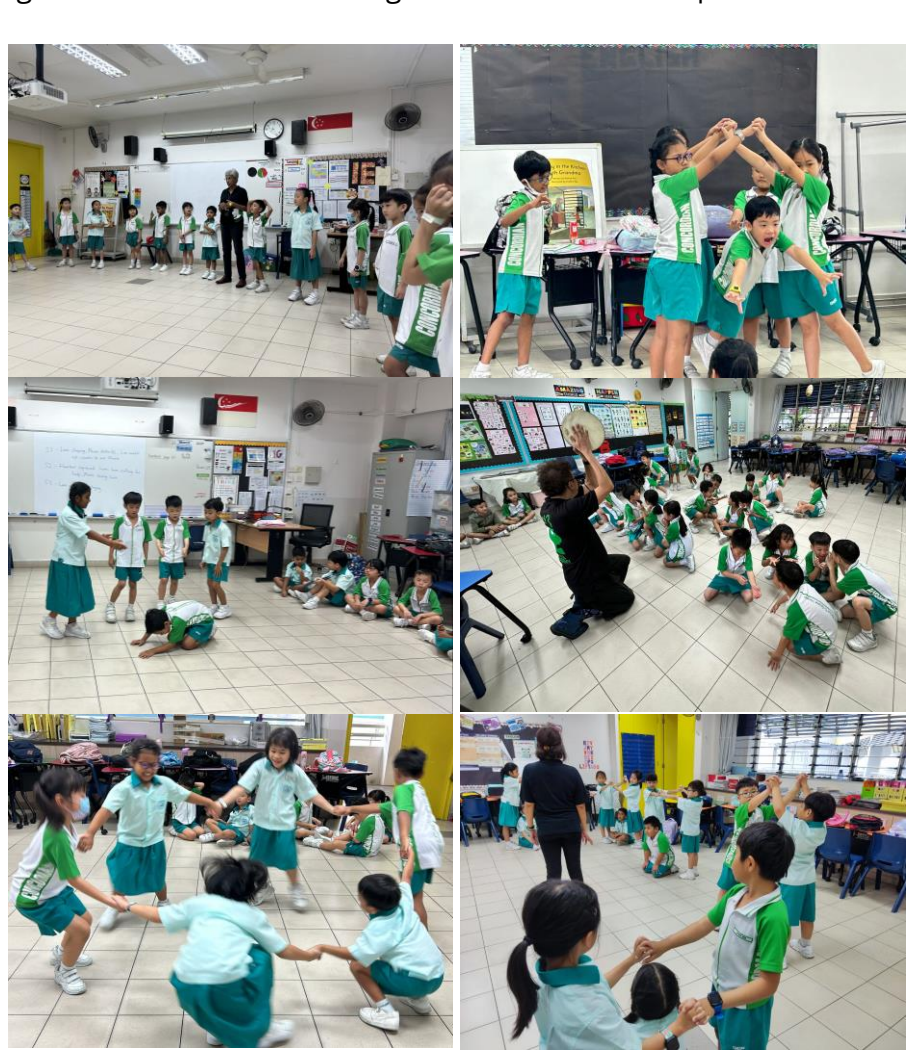
Students enjoying their drama lessons.

As the weeks unfold, our students will delve deeper into the fundamental principles of drama, guided by the 5 Ps - Pronunciation, Pitch, Pace, Pause and Power. At the end of the 8 weeks, our students will have the opportunity to showcase their burgeoning talents on the drama stage of our school library, presenting their creations to an eager audience of their peers.