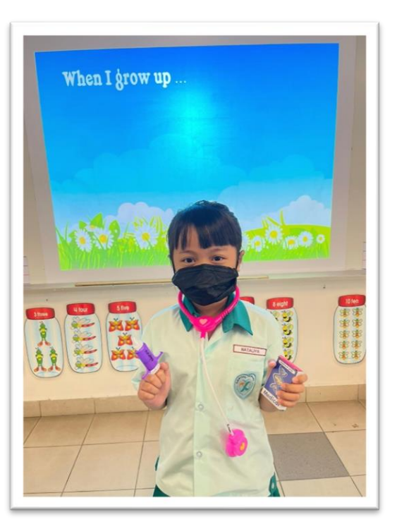
English Show-and-Tell Session