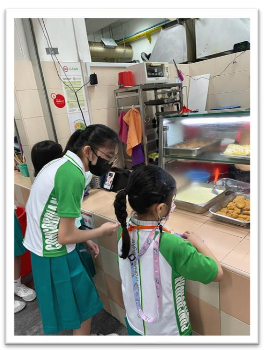
Primary Six recess buddies with Primary One students

OFFICIAL (CLOSED OFFICIAL) / SENSITIVE (NORMAL)