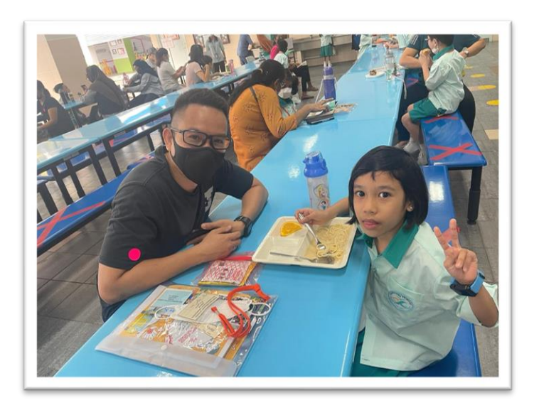
Day One recess with parents

The following week was an engaging and discovery session for our Primary One students. Students were matched to their Primary Six buddies and were brought around the canteen to learn about the different stalls and the various Safe Management measures. Primary Six buddies took care of their Primary One buddies well and even brought them to enjoy the Koi Pond and the surrounding vicinity.