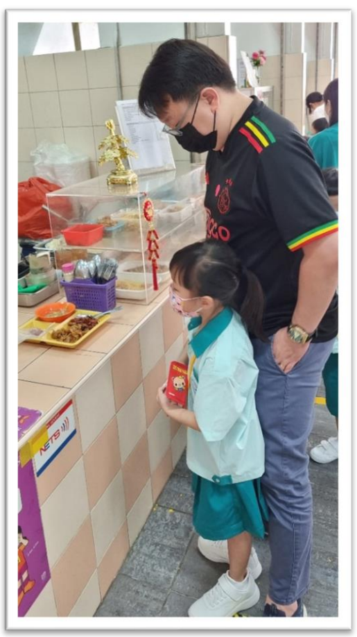
Parents teaching their child how to wash their hands before eating and purchase food from the canteen stall

OFFICIAL (CLOSED OFFICIAL) / SENSITIVE (NORMAL)