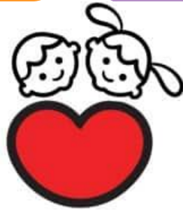
BIG HEART STUDENT CARE