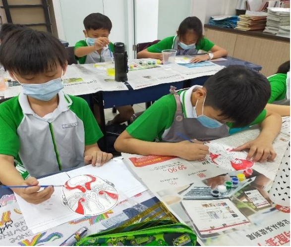
Our Primary 4 students learned about Chinese Opera, and had a chance to paint an opera mask. Students enjoyed their experience in painting the masks with bright colours.