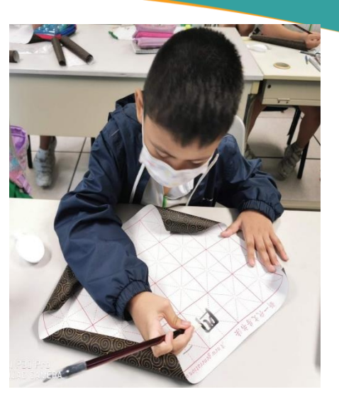
Our Primary 3 and 4 students had a close-up experience in Chinese culture. The Primary 3 students went through a hands-on session on writing Chinese Calligraphy. It was definitely not an easy feat!