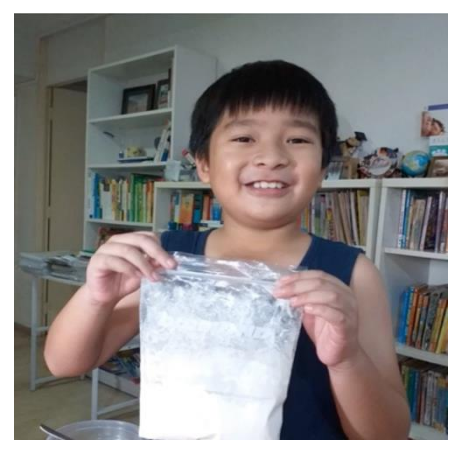
Primary 4 students learning how to make their own ice cream from English Stellar Unit.