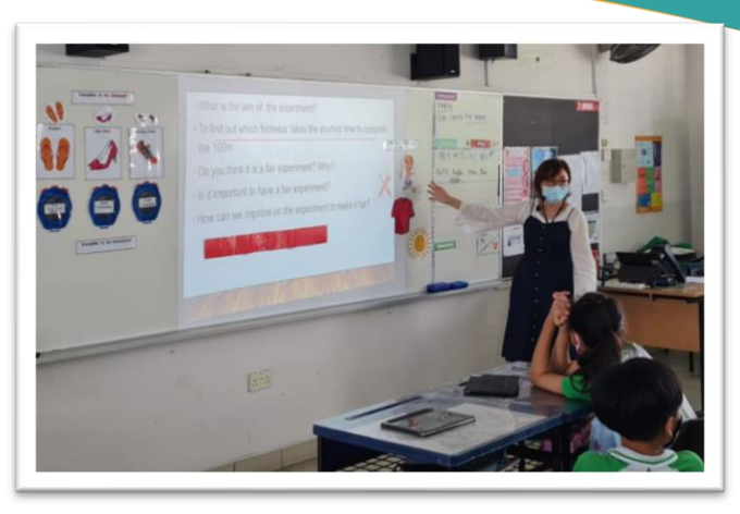
A Science Lesson Study on 'What is a Fair Test'.