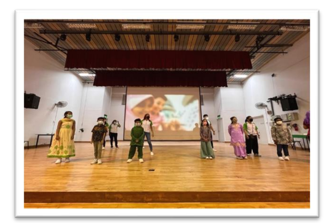
RHD Celebration in the hall

The school celebrated Racial Harmony Day on 18<sup>th</sup> July 2022, with Concordians coming into the school dressed in their ethnic wear. The theme for this year's Racial Harmony Day, "Our Multicultural Mosaic", reflects how each community, while having the space to express its own identity as part of Singapore society, also intertwines with others to depict the unique cultural diversity that characterises Singapore's life.